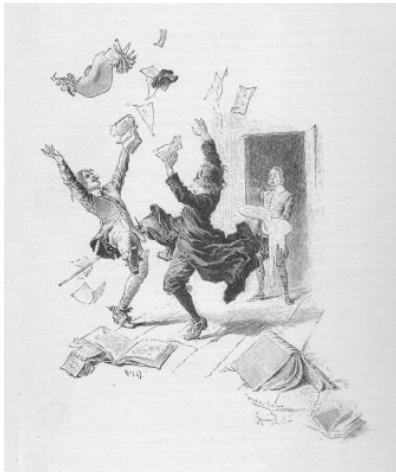
Scene of locals after receiving news of Swindlers Fair coming to town

Back due to overwhelming popular demand. You are again going to be graced by the presence of perhaps the most widely travelled and eclectic show, brought to you by Honest Jack Swindler. A wider display of freaks, dangerous acts of peril and exhilarating performances you will not see. All the old favourites will be there and of course some brand new acts from far and wide.