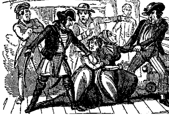
Artists impression of terrible murders conducted by n'er do wells

The authorities are taking a pragmatic approach and locals are calling for action. A fund has been set up by Sir Jeffrey Beckitt of ten guineas for information that leads to the unmasking of the vile villains responsible for these acts of despicable savagery. When asked if anyone was safe Captain Dare advised to stay clear of strangers and shoot any suspicious types and call for the militia at once.